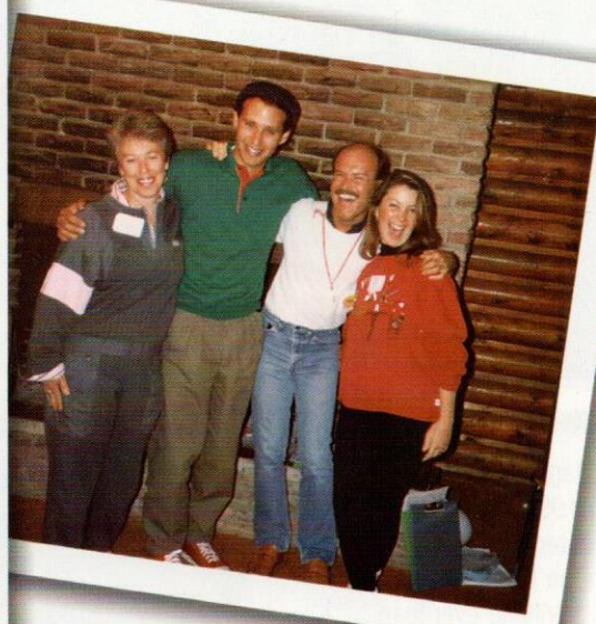
San Francisco Village Music for Peace 1988 Staff